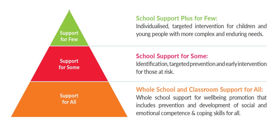
Figure 1: The DES Continuum of Support

Support provided by the Department of Education will utilise the usual school support structure – the Continuum of Support (Figure 1). This support structure allows schools to provide universal support for all students, using prevention and early intervention approaches, to support wellbeing and transition back to school. The Continuum of Support framework also recognises that some students who continue to struggle to settle, despite the provision of universal supports, will require more targeted support, while still others with more complex need will require an individualised approach to support.